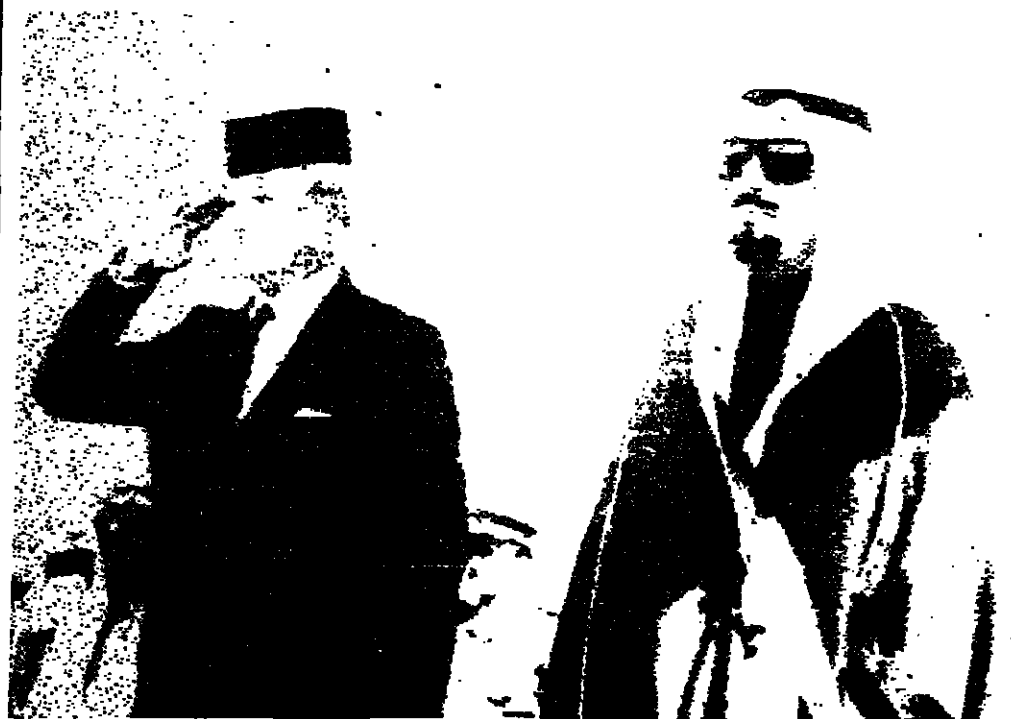
The Amir of Kuwait, Sheikh Jaber Al Ahmad Al Sabah, receive the Malaysian king and queen at the Kuwait airport Monday.